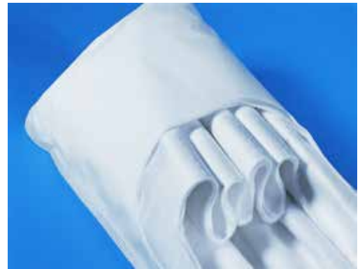
A pleated pre-filter offers a very large filter area (approx. 32 ft² (3 m²)), to retain gels and solids before they reach subsequent filter layers.