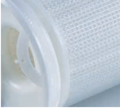
Strong cage supports the filter element during harsh conditions