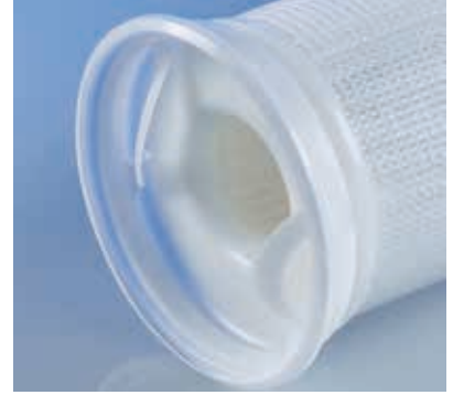
Bypass-free sealing through SENTINEL seal ring