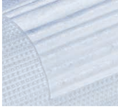
Pleated structure with extended-life media provides vastly increased dirt-holding capacity