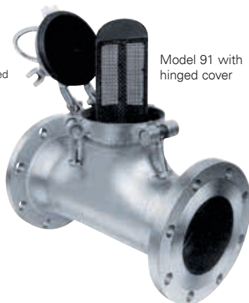
Model 91 with hinged cover

Eaton customizes the strainers to meet special application requirements. Design and fabrication to "AD 2000-Merkblätter", DIN EN 13445 or ASME Code and ANSI B31.1 are available.