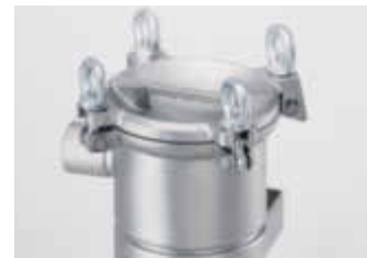
Ergonomic, integral cover handle is easy to open and close

Viton® is a registered trademark of E. I. du Pont de Nemours and company.