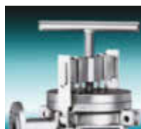
SIDELINE with T-bolt closure (TSBF)