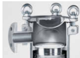
Compression bag hold down creates 360 degree sealing between filter bag and bag filter housing