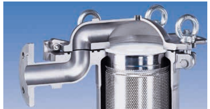
Top inlet connection with hinged cover make filter bag change-outs quick and easy