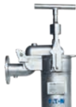
TOPLINE with T-bolt closure (TTBF)

Viton® is a registered trademark of E. I. du Pont de Nemours and company.