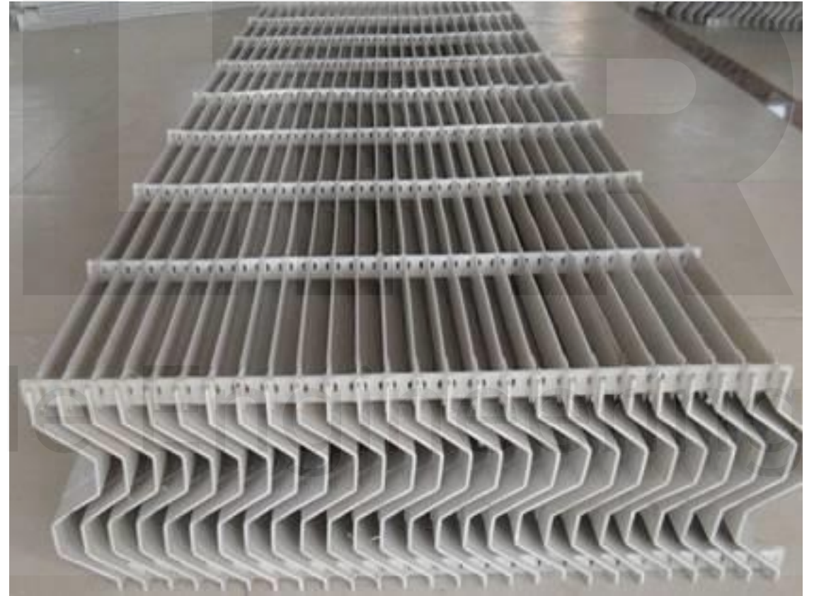
Plastic vane demister pad.