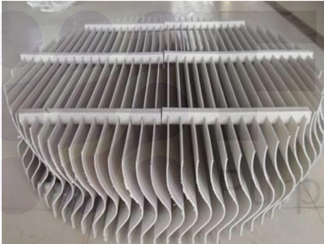
Round shape vane demister pad.