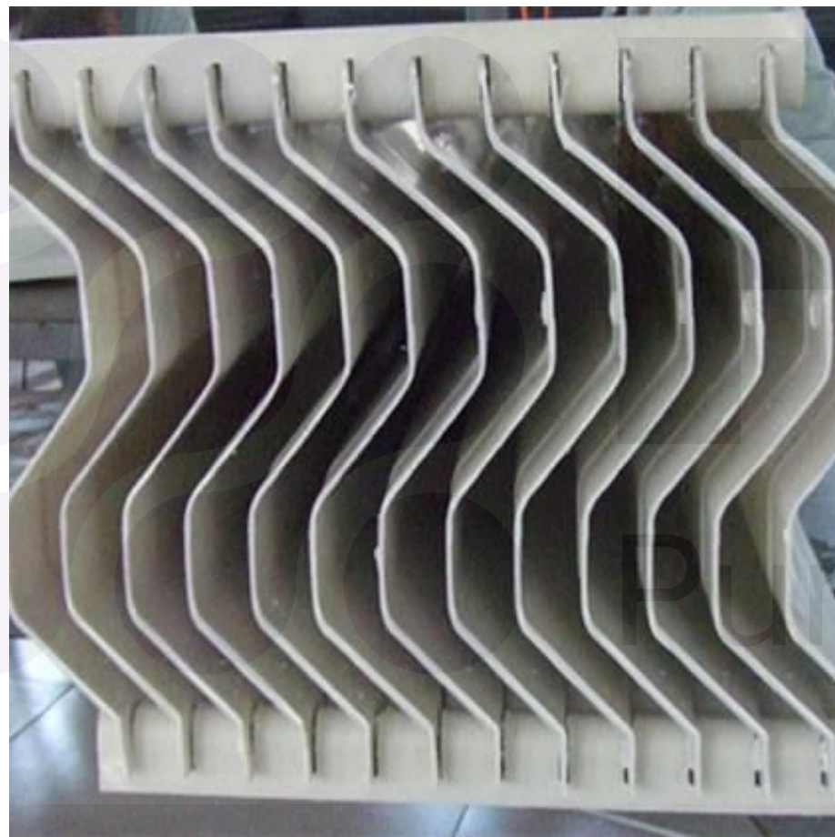
Smooth blade vane demister pad.