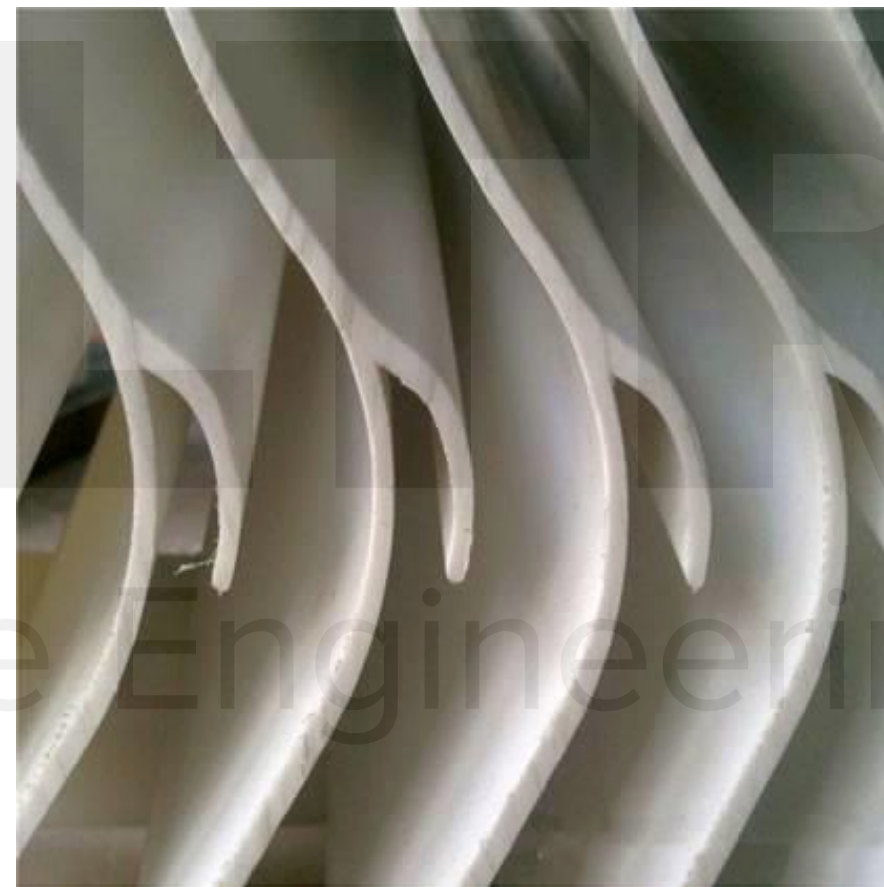
Hook blade vane demister pad.