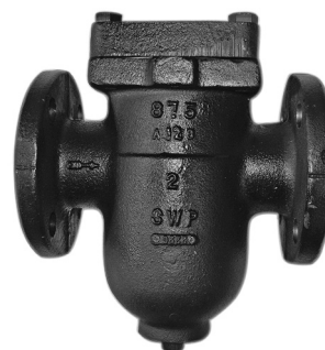
Models 165-B, 166-B