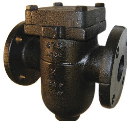
Models 165, 166-DI *165-DI available upon request. Consult Factory.