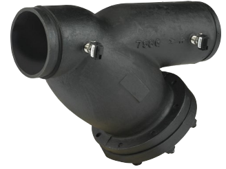
Model 758G SM

Call customer service if you need assistance with technical details.