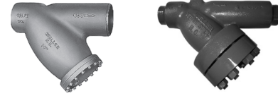
Models: 764, 765, 765M, 766, 766M, 767

Models: 764-WE, Class 600 765M-WE*, Class 900 766M-WE*, Class 1500 767-WE, Class 2500 Sizes: 1/2" – 12" (15 – 300mm)