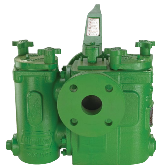
Model 791MFA SM

The information contained herein is not intended to replace the full product installation and safety information available or the experience of a trained product installer. You are required to thoroughly read all installation instructions and product safety information before beginning the installation of this product.