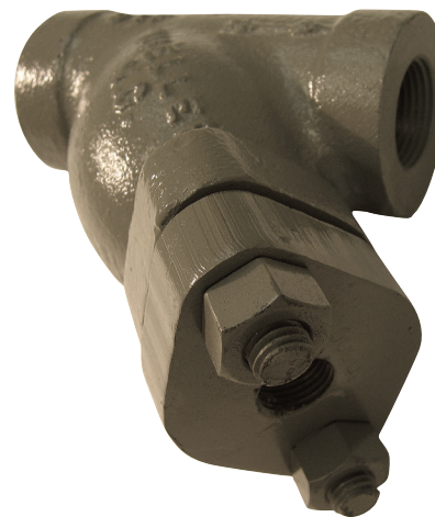
Models 861BC, 862BC