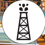
NATURAL GAS PRODUCTION AND PROCESSING